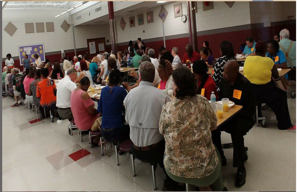
Parents receiving valuable information at a school's parent night

Additionally, the Title I department will provide training to principals so principals will understand parent and family engagement requirements and plan opportunities for family engagement activities and meetings for the remainder of the school year.